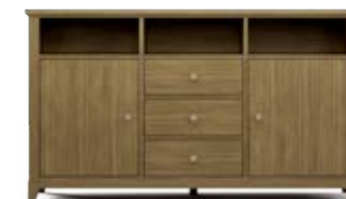
J 2 Door, 3 Shelf, 3 Drawer 72w 20d 42h