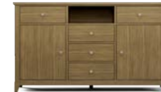
G 2 Door, 1 Shelf, 5 Drawer 72w 20d 42h