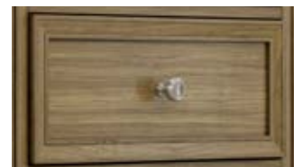
5 Mitered Moulding