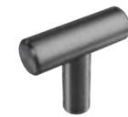
Antique Nickel Harbor Style