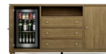
R *Refrigerator Compatible Unit 84w 20d 42h