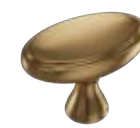
Honey Bronze Oxbow Style