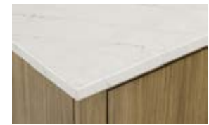
L Light Stone - Standard 20"