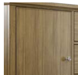
2 Single Bead