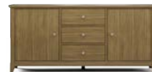
A 2 Door, 3 Drawer 72w 20d 33 1/4h