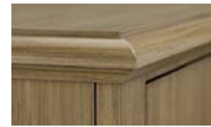
I Wood Top - Cove Edge