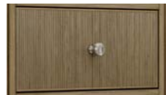
4 Reeded Panel