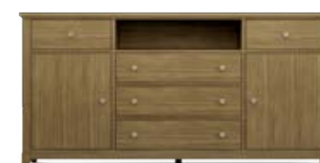
X 2 Door, 1 Shelf, 5 Drawer 84w 20d 42h