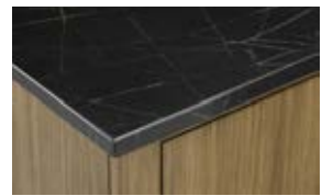
D Dark Stone - Standard 20"