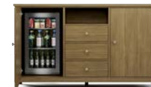
M *Refrigerator Compatible Unit 72w 20d 42h