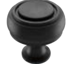
Matte Black Drift Style