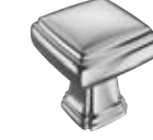
Chrome Riverbend Style