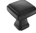
Matte Black Riverbend Style