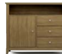
V 1 Door, 1 Shelf, 3 Drawer 49 3/4w 20d 42h