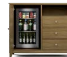
P *Refrigerator Compatible Unit 49 3/4w 20d 42h