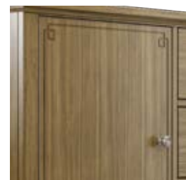
6 Greek Key