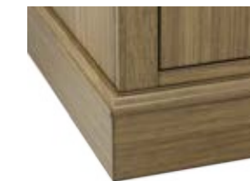
5 Plinth Solid