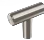
Brushed Nickel Harbor Style