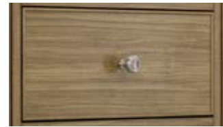
2 Single Bead