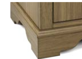
6 Plinth Bracket