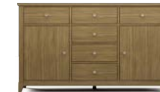
E 2 Door, 6 Drawer 72w 20d 42h