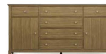
Y 2 Door, 6 Drawer 84w 20d 42h