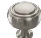
Brushed Nickel Drift Style