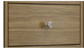
1 Modern (Clean)