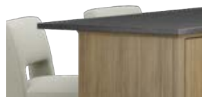
E Dark Stone - Bar Top 28"