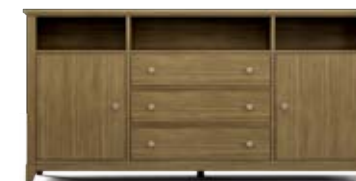
W 2 Door, 3 Shelf, 3 Drawer 84w 20d 42h