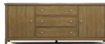
Z 2 Door, 3 Drawer 84w 20d 33 1/4h