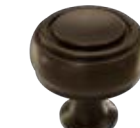
Honey Bronze Drift Style