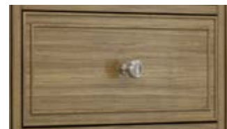
3 Double Bead