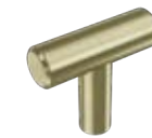
Satin Brass Harbor Style