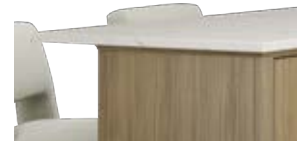
M Light Stone - Bar Top 28"