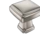
Brushed Nickel Riverbend Style