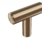
Champagne Bronze Harbor Style