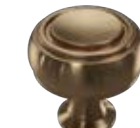
Champagne Bronze Drift Style