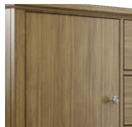
1 Modern (Clean)