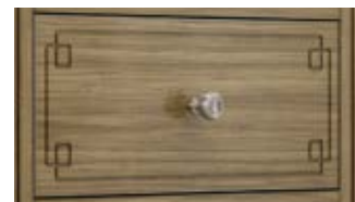
6 Greek Key