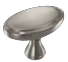
Brushed Nickel Oxbow Style