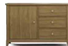
H 1 Door, 3 Drawer 49 3/4w 20d 33 1/4h