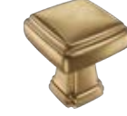
Brushed Gold Riverbend Style