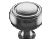
Chrome Drift Style