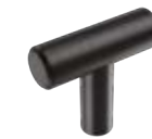
Oil Rubbed Bronze Harbor Style