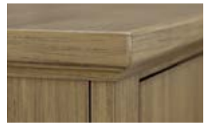
4 Wood Top - Square Edge