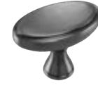
Antique Nickel Oxbow Style